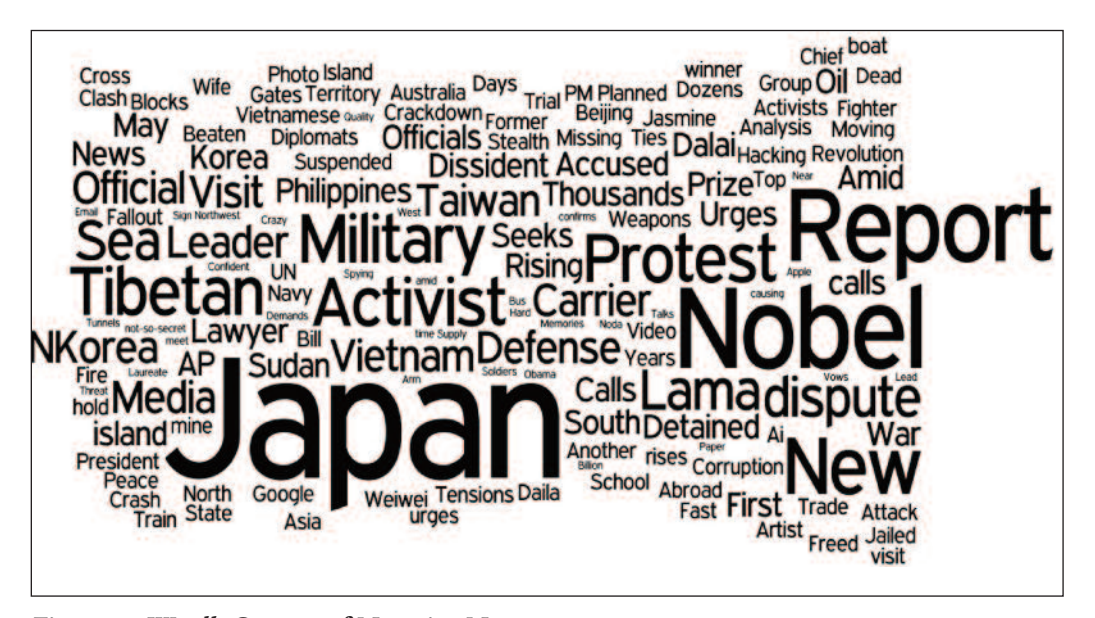
Figure 3: Wordle Output of Negative News Headlines between August 2010 and November 2011

During this period, Wordle outputs of the words Philippines, Vietnam and Japan, took place within the context of how the three countries perceived a bona fide threat by an expanding Chinese military. The news headline on June 23, 2011, notes how Chinese warships were patrolling off Japan. Moreover, India reported on September 3, 2011, that one of its own ships en route to visit Vietnam was warned by the Chinese Navy that it was in Chinese waters. Furthermore, there were reports on Chinese officials welcoming a Sudanese leader accused of war crimes (see headline on June 16, 2011) as well as its engagement with the US in an "internet war" (see headline June 3, 2011). Not surprisingly, the Wordle output in Figure 2 includes the word "Defense" somewhat prominently, with one report about China's criticism of the United States' sale of upgraded F-16 jets to Taiwan