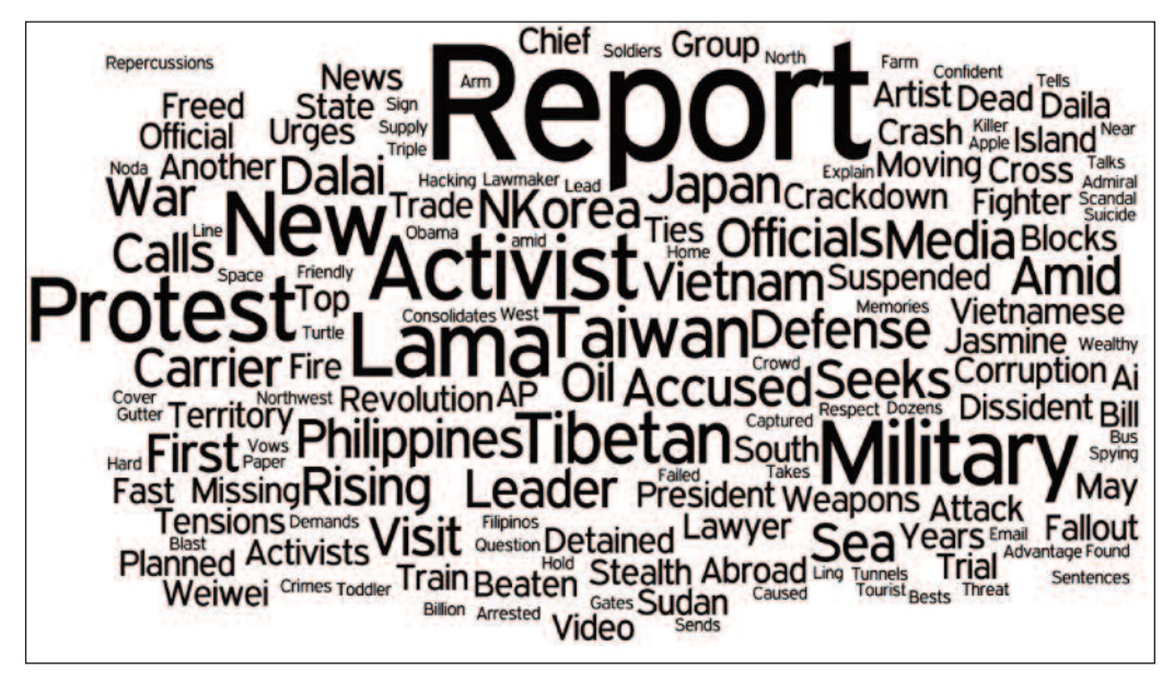
Figure 2: Wordle Output of Negative News Headlines between January and November 2011

In Figure 2, compiled from headlines collected between January and November 2011 (seen in Table 2), the Wordle output shows distinctly different themes. Issues with Japan subsided during this period, but the word "Report" figures prominently in the illustration. By revisiting Table 2, one can see that often the word "Report" is used as a qualifier in the headlines of the period to create a sense of urgency. This can be seen in the January 10, 2011 report titled "Report: Chinese Troops Cross into Indian Territory" and the February 10, 2011 report titled "Report: Hackers in China Hit Western Oil Companies." In other uses of the word "report," Chinese officials are seen condemning US reports on the Chinese military as well as the suspension of a Chinese journalist who wrote